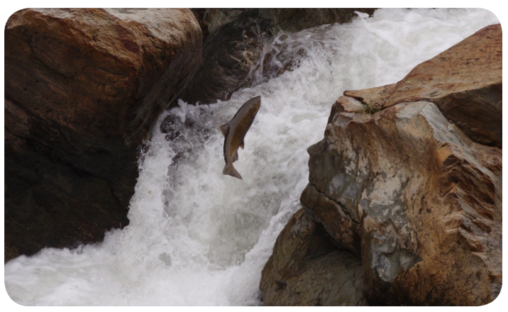
Chinook, Klamath River