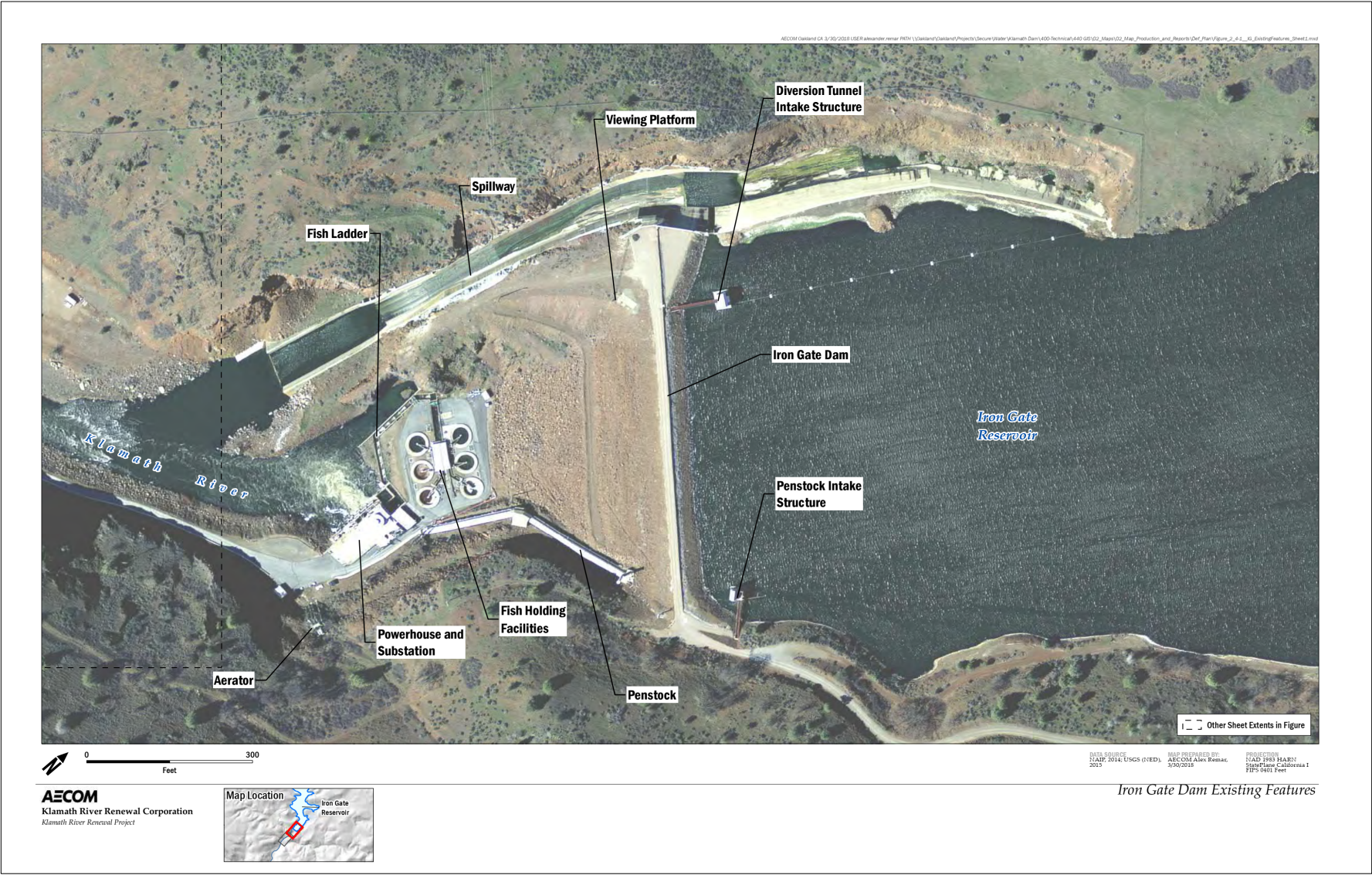
Figure A-8. Iron Gate Dam Existing Features in Proposed Action