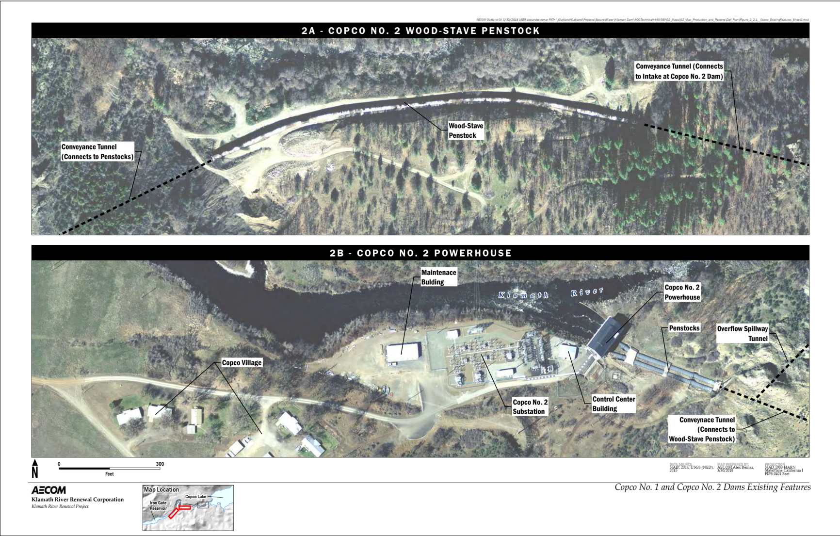
Figure A-6. Copco No. 2 Wood Stave Penstock and Powerhouse in Proposed Action