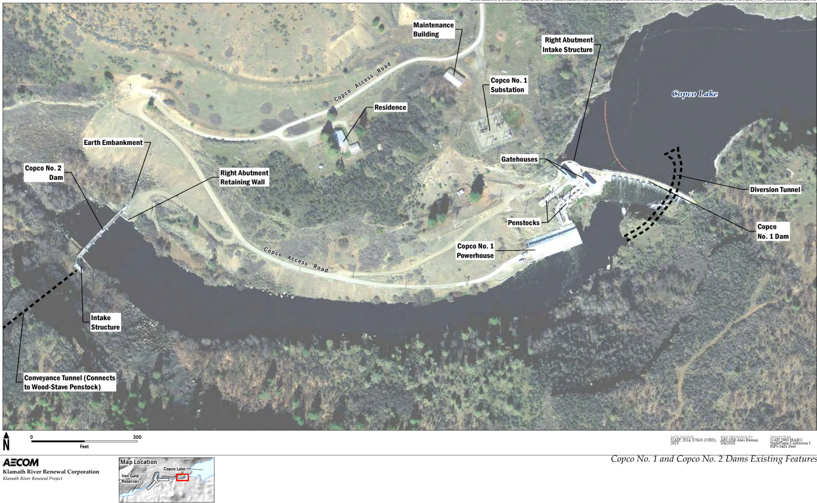
Figure A-5. Copco No. 1 and Copco No. 2 Developments' Features in Proposed Action