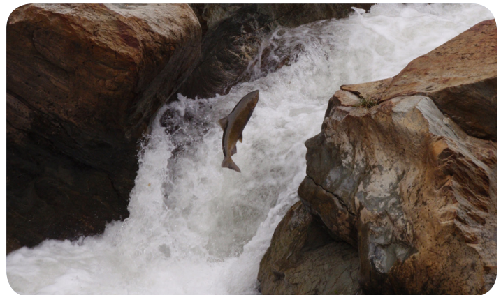
Chinook, Klamath River